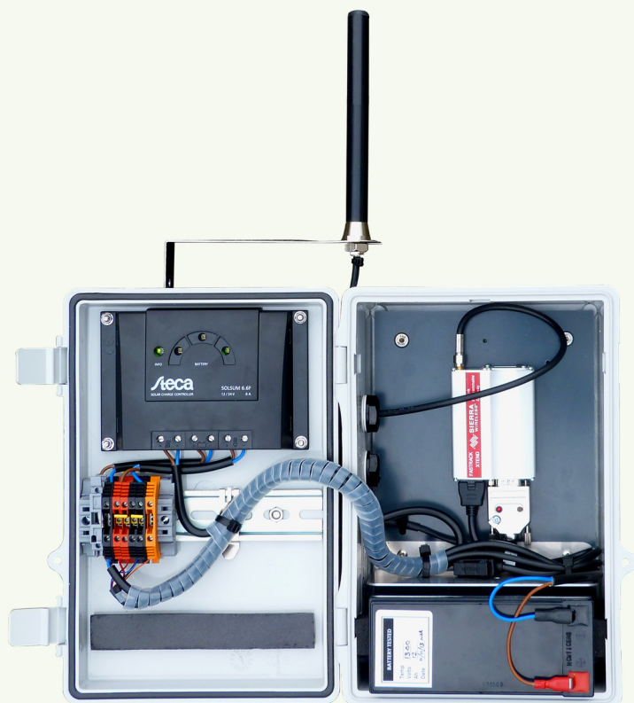
GPRS-DLC-BX1/SP and GPRS-BX1/SP Modem Box